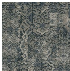
Timeless 85402 LRV 18.6