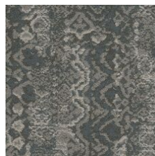
Heritage 85530 LRV 14.6