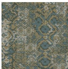
Novelty 85327 LRV 18.2