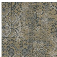
Classic 85496 LRV 19.1