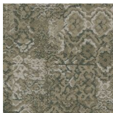
Recollect 85215 LRV 21.3