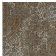
Nostalgic 85665 LRV 16.2